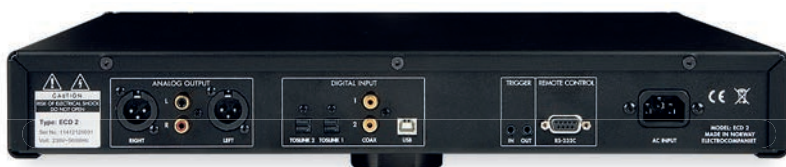
ABOVE: Both single-ended (RCA) and balanced (XLR) outputs are provided and the ECD 2 has additional trigger/RS232 connectivity for use in a fully integrated set-up