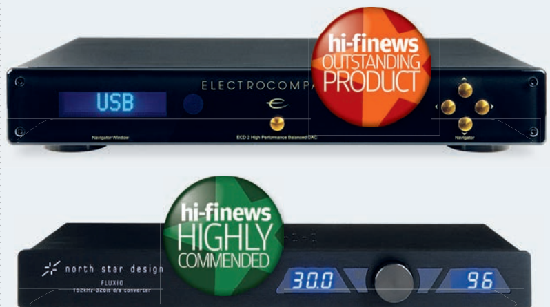
ABOVE: The stylish £1650 North Star Fluxio is 'laid-back but very inviting' but Electrocompaniet's £1950 ECD 2 surpasses the lot with its all-round performance

'Whichever input you choose, the ECD 2 rewards effortlessly'