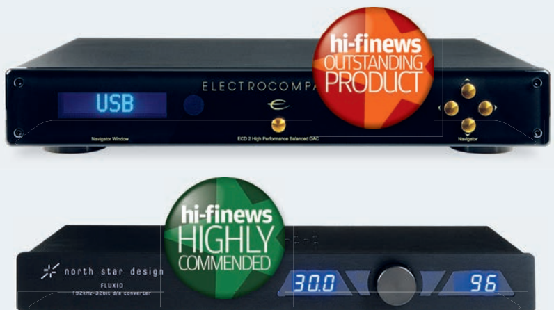
ABOVE: The stylish £1650 North Star Fluxio is 'laid-back but very inviting' but Electrocompaniet's £1950 ECD 2 surpasses the lot with its all-round performance

'Whichever input you choose, the ECD 2 rewards effortlessly'