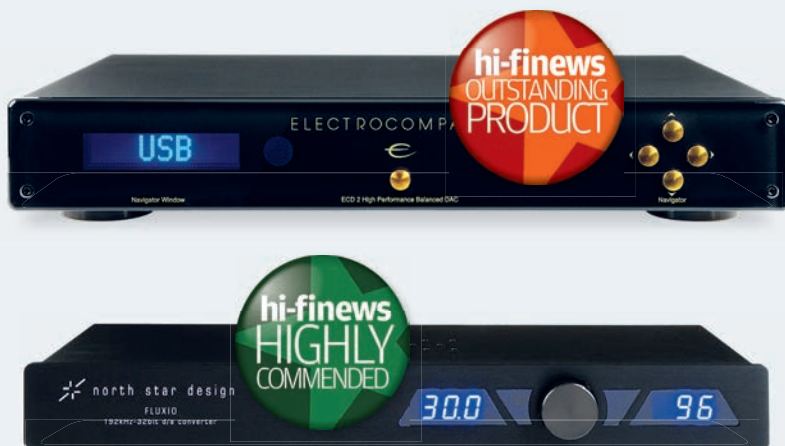
ABOVE: The stylish £1650 North Star Fluxio is 'laid-back but very inviting' but Electrocompaniet's £1950 ECD 2 surpasses the lot with its all-round performance

'Whichever input you choose, the ECD 2 rewards effortlessly'